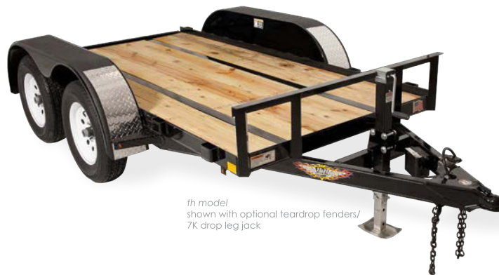
th model shown with optional teardrop fenders/ 7K drop leg jack