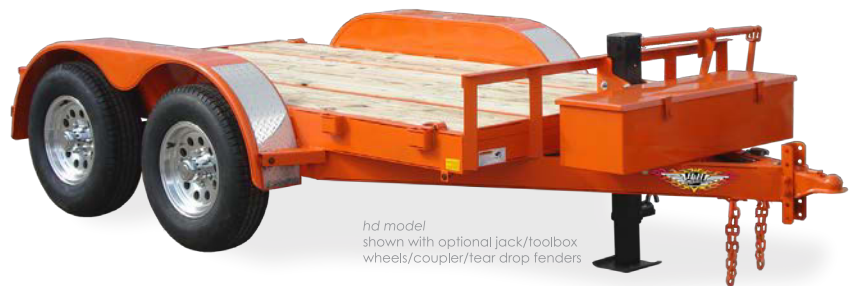
hd model shown with optional jack/toolbox wheels/coupler/tear drop fenders